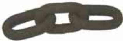
Mining Chain Ref: FC