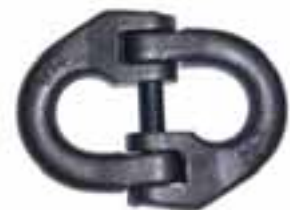
Chain Connector Ref: CF