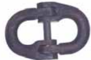
Component Connector Ref: CCF