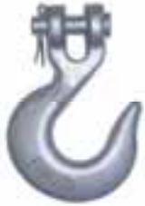
Carbon Steel Clevis Slip Hooks Ref: CSH