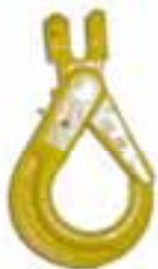
Grade 80 Safety Clevis Hooks CLG Type Ref: CHS