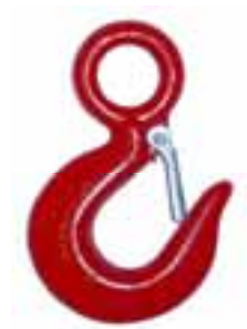
Red Painted Alloy Steel Eye Hooks c/w Latch Ref: AEH