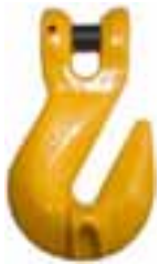
Grade 80 Clevis Grab Hooks Ref: YCGSH