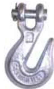
Carbon Steel Clevis Grab Hooks Ref: CGH