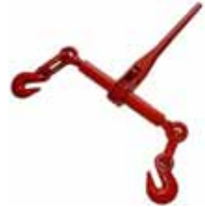
Ratchet Type Loadbinders Ref: RLB