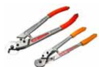
Marvel Wire Rope Cutters Ref: MI/MSH