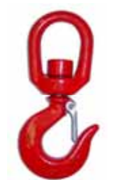
Red Painted Alloy Steel Swivel Hooks c/w Latch Ref: ASH