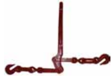
Lever Type Loadbinders Ref: LLB