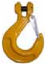
Grade 80 Clevis Sling Hooks c/w Latch Ref: YCSH